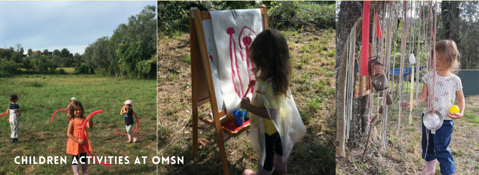
CHILDREN ACTIVITIES AT OMSN

This activity involves providing support to the educators at the Escola da Floresta (Forest School) and Escola do Mundo (World School) of the OMSN learning center. The volunteers will support the educators by assisting in the daily activities for children, preparation of meals and cleaning of kitchen, supporting children meal time, preparation of educational materials, assisting group activities, providing individualized attention to students who need extra support, among others and accordingly to their interests and skills.