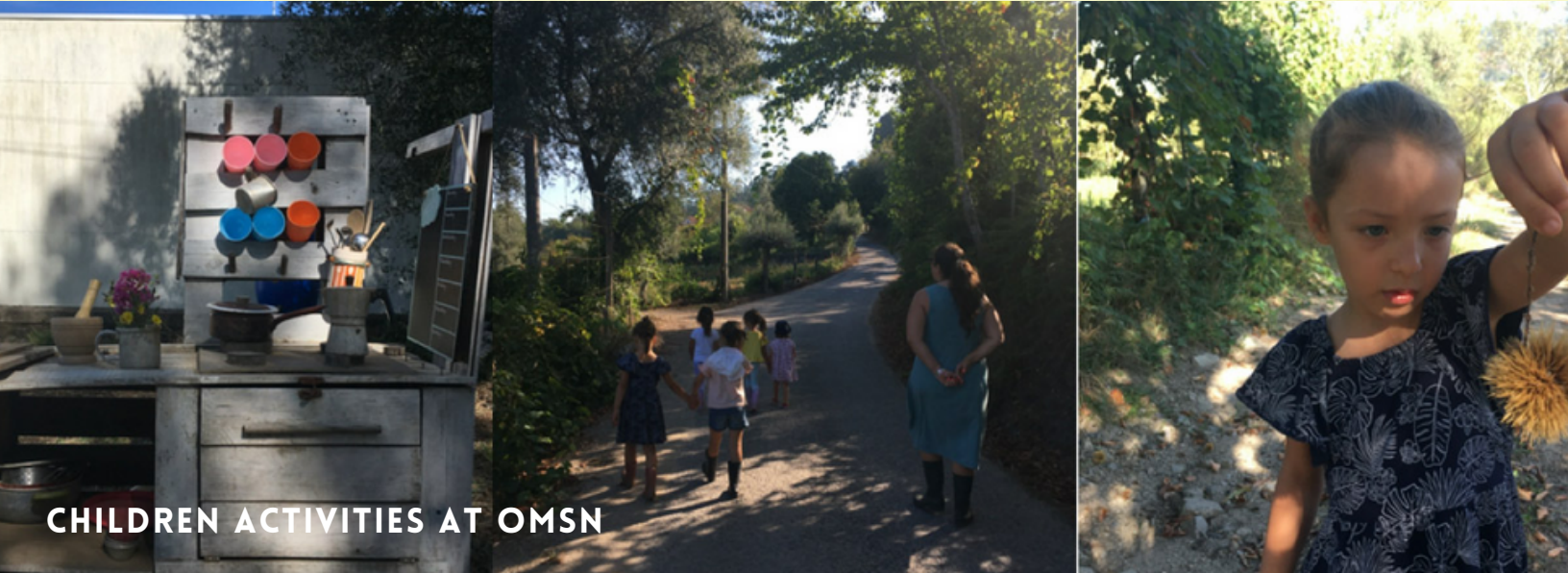
CHILDREN ACTIVITIES AT OMSN

The 11-month volunteering project at OMSN offers opportunities for 4 young people (18-30 years old) from EU countries to participate in solidarity activities that contribute to the daily activities of the OMSN organisation and, ultimately, benefit the communities in which these activities are carried out.